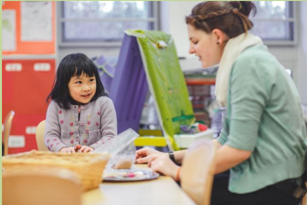
Educating our youngest dual language learners